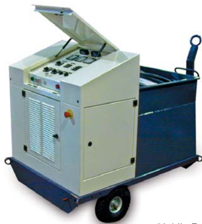
Mobile Frequency Converter 50/400 Hz. 10 – 40 KVA or mobile 28 VDC unit 600/2000A