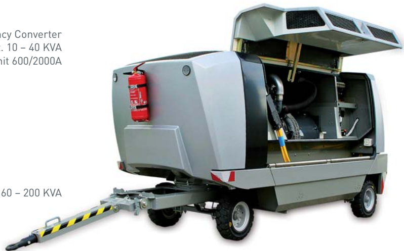
Mobile Frequency Converter 50/400 Hz. 60 – 200 KVA